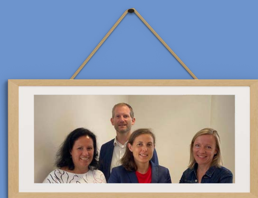
Signing of the Articles of Association 9 th of September 2022